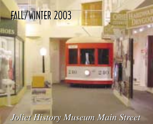
Joliet History Museum Main Street