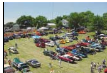
Car Show at Billie Limacher Bicentennial Park