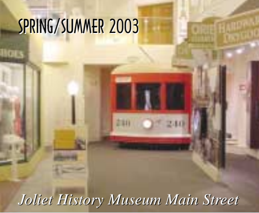
Joliet History Museum Main Street