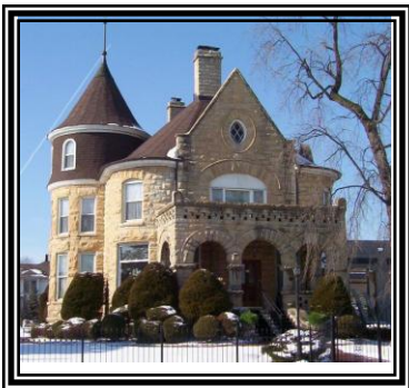
Patrick C. Haley Mansion